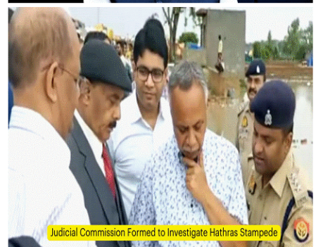
Judicial Commission Formed to Investigate Hathras Stampede